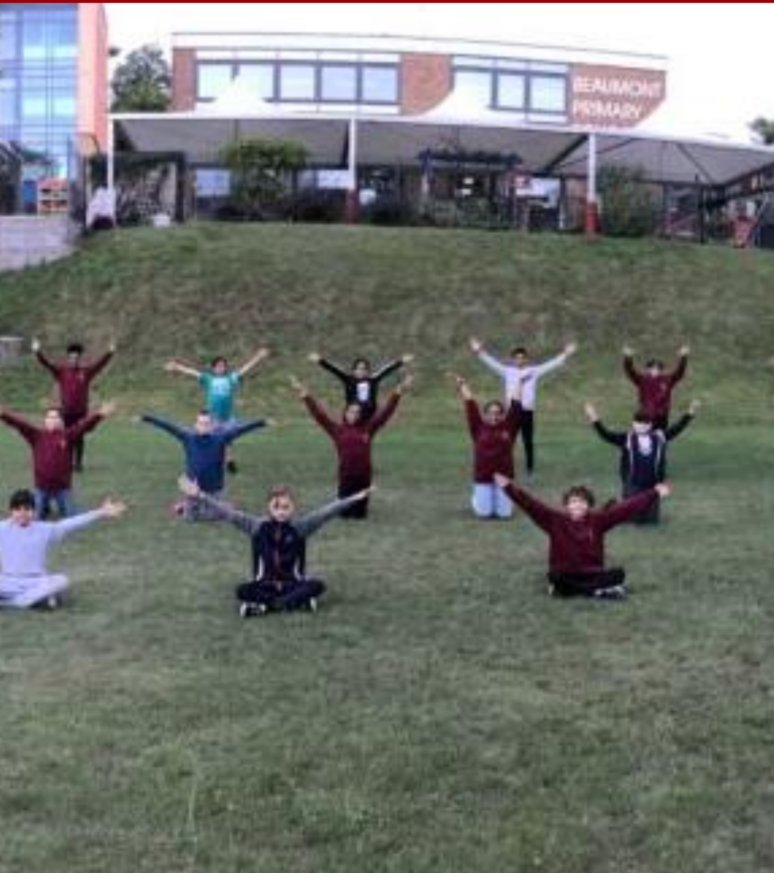
Friends of Beaumont